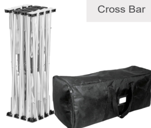
Executive Banner Wall System and Carry Bag